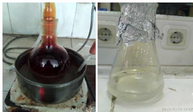
Figure 1. Wet destruction process and the result

The destruction process is carried out at a temperature of 100 °C, the destruction is carried out on a bath in a fume hood so that the steam produced directly goes out into the free air and does not poison the surrounding environment. Eleven prepared samples have different destructive time spans, the average sample being able to be destroyed for 2 to 5 hours. Some samples that are difficult to experience an overhaul will be destroyed for 11 hours (TB7, TB8, TB10 and TB13), because the texture of the sample is very dense. Destruction was carried out three times over to get 150 mL which was used as a qualitative and quantitative analysis.