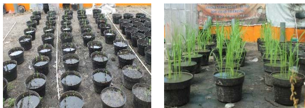
Figure 2. Experiment in the field