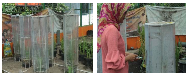
Figure 1. Closed chamber and taking N 2 O gas

Suction and release of gas with a syringe are carried out several times (at least 3 times), then pull the syringe on the scale needed to suck the gas and the regulating faucet is immediately closed and pull the needle from the lid. The syringe that has been filled with gas from the hood is then injected into an available vacuum tube and labeled an observation sample, open the regulating faucet and push the tip of the syringe to insert N 2 O gas from the syringe into the vacuum tube to the tube base position. Perform closure of the regulating faucet and pull out the syringe from the vacuum tube. All gas in the syringe has been inserted into the vacuum tube.