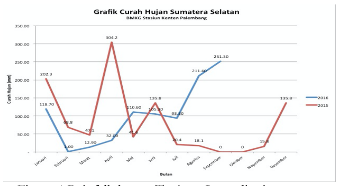
Figure 4 Rainfall data at Tanjung Lago district year 2015 and 2016

contribution of ground water to supply water approximately 65% of potential evapotranspiration need [11].