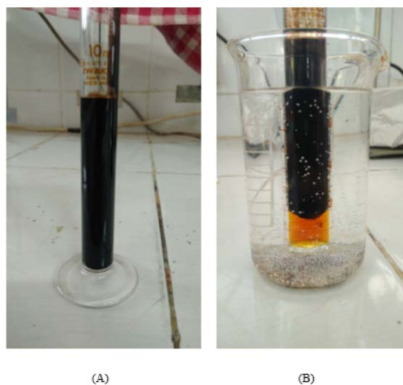
Figure 2. Pyrolysis Bio-Oil: (2a) before and (2b) after demulsification process.

This experiment was conducted with the aim to determine the ability of demulsifiers to break down water-in-oil emulsions present in bio-oil and to see the relationship between demulsifier doses to demulsification efficiency so that the optimum dosage for the demulsification process can be known. When the demulsifier works, the interfacial layer surrounding the droplets of water is thinning and then breaks causing the water droplets to separate from bio-oil and over time they will join each other and form a layer of water which is then under the bio-oil layer. The formation of these two layers is due to the difference in density between water and bio-oil itself. Two different conditions of bio-oil products as shown in Figure 2, namely before and after the demulsification process.