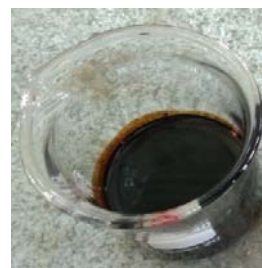
Figure 1. Pyrolysis Bio-Oil Products from Palm Empty Fruit Bunch.

From Figure. 1, it appears a dark, slightly thick oily liquid which is characteristic of bio-oil products themselves.